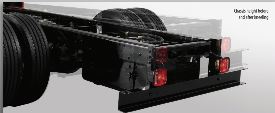
Chassis height before and after kneeling